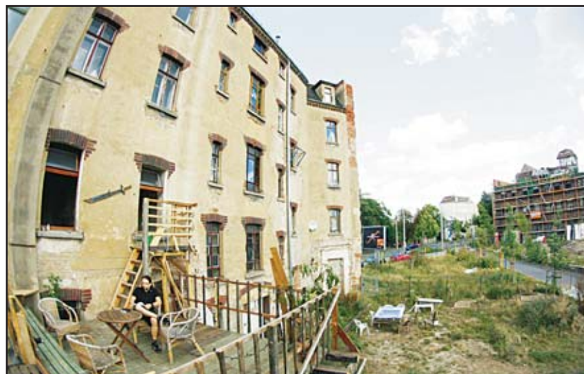
Artist Nils Franke sits on a terrace in front of a guardian building in Leipzig, Aug 13. Like many East German cities, Leipzig suffered depopulation after the country's unification in 1990, with many inhabitants leaving for West Germany or moving to modern suburban homes. Now a colourful mix of artists, yoga teachers and young entrepreneurs, some 120 people are acting as 'guardians' to formerly abandoned homes, reinstalling electricity in the derelict buildings, fixing floors, windows and roofs and making sure no squatters move in. (RTRS)

But looking at the colourful group carrying tools into the building, he added: "I just hope they won't be too loud." (RTRS)